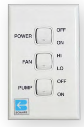
Two speed control

In the interest of continued product improvement, Bonaire reserves the right to alter specifications without notice. E. & O.E.