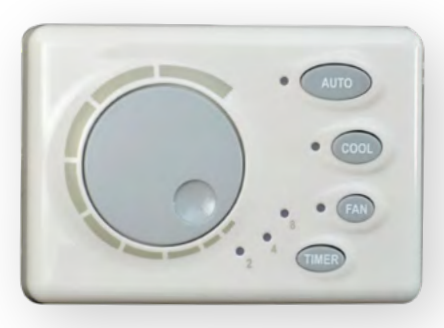
Variable speed control