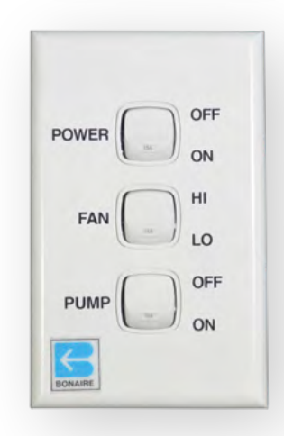
Two speed control