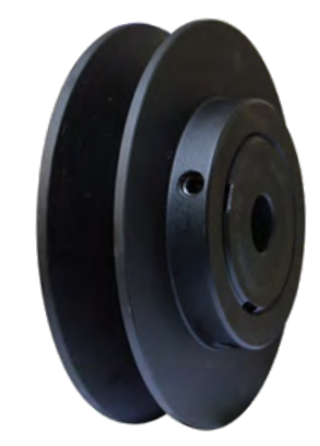
Variable pitch pulley

Additionally, the variable speed control comes with a programmable timer.