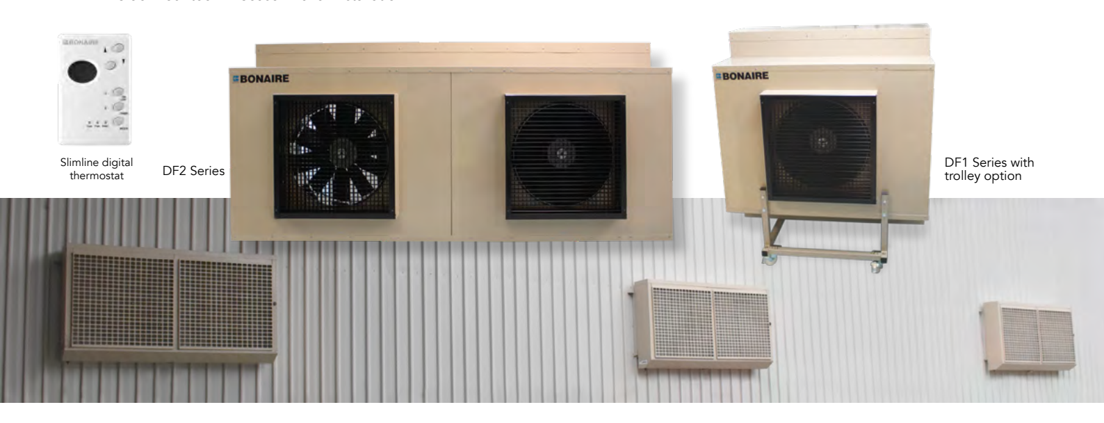
Roof mounted traditional installation